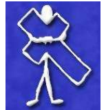
Ta-Pa-Win-Go Student Ministries

Please Clip and Mail Registration by April 11, 2023 Or Register Online at www.cbmcamp.com